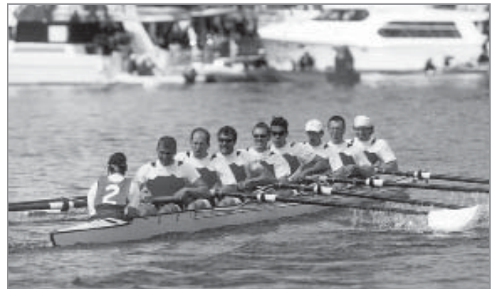
The Croatian men's team won the 2001 Windermere Cup with the same crew that won bronze at the 2000 Olympic Games